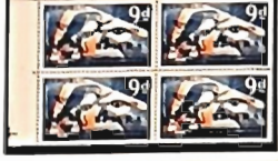
Imperforated through left margin