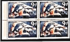
Perforated through left margin