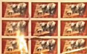
Illustration No. 2.7.78