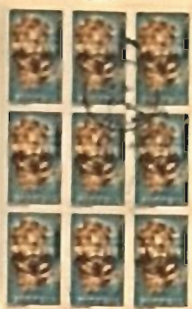
Illustration No. 2.7.78

Nigeria Not used for Air Mail Issue Overprinted in Black UNACHIEVED CATALOGUE STATUS - FRANCE FRIENDSHIP Overprinted in Black and Local Postage - Surcharge Originally Achieved Catalogue Status but Since 1991 Been Not Listed Never Issued to Biafran Post Offices nor Performed Local Postal Duty Only Offered for Sale Outside Biafra