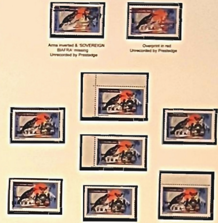
Area inverted & SOVEREIGN BIAFRA missing. Unrecorded by Postage

Varieties and Shifting Positions of the Overprint on the 10d