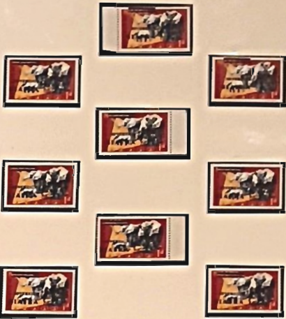
Numbers printed: 10d 10,800

Shifting Positions of the Overprint on the 10d